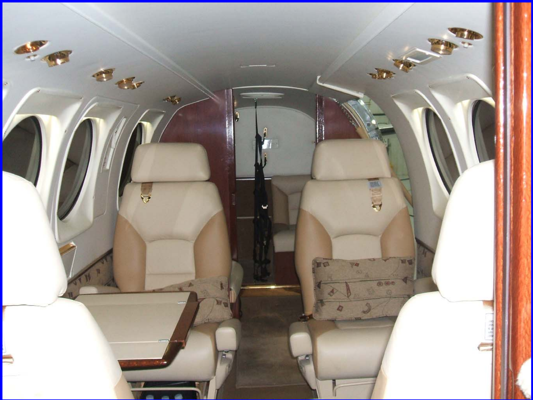
Specifications are preliminary and are subject to verification by purchaser Engine and Airframe times are current as of February, 2011