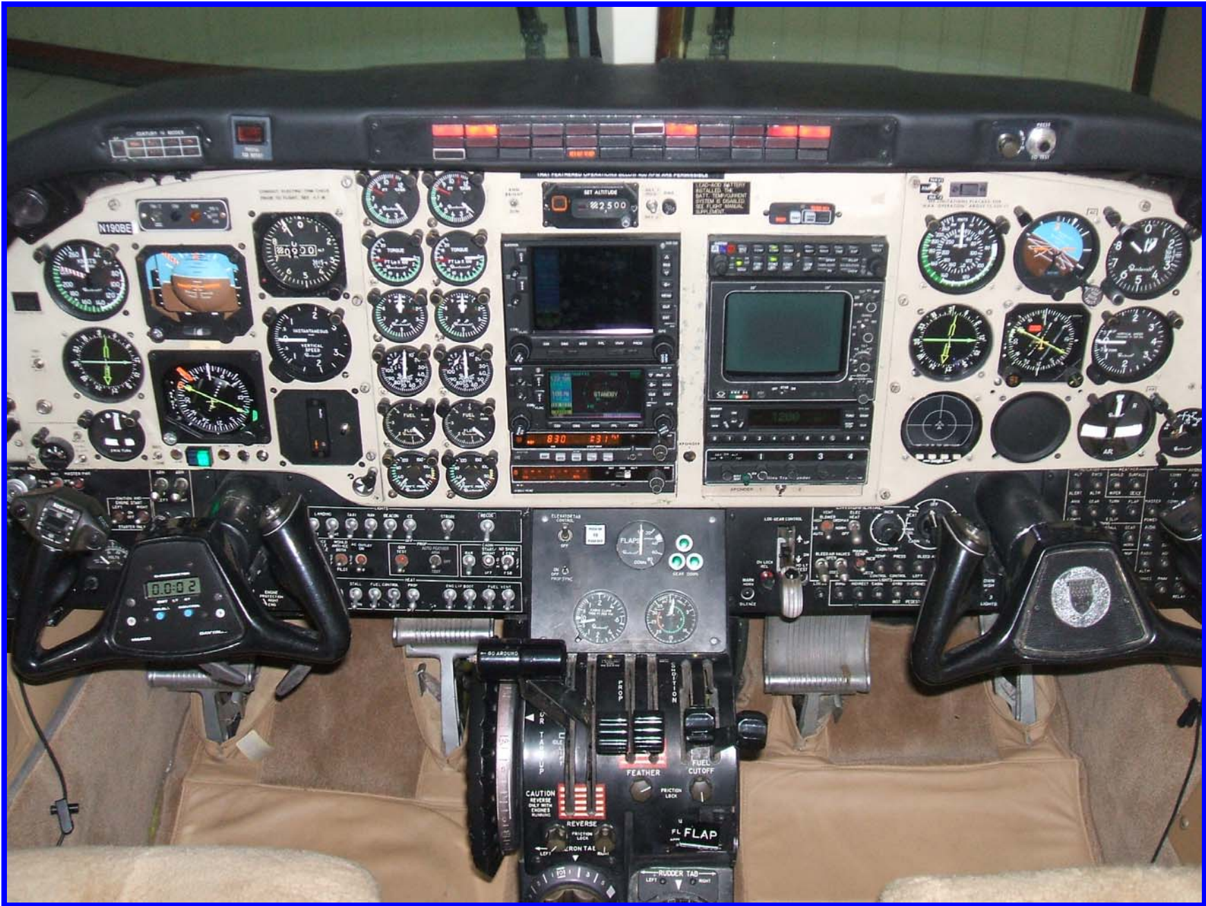
Specifications are preliminary and are subject to verification by purchaser Engine and Airframe times are current as of February, 2011