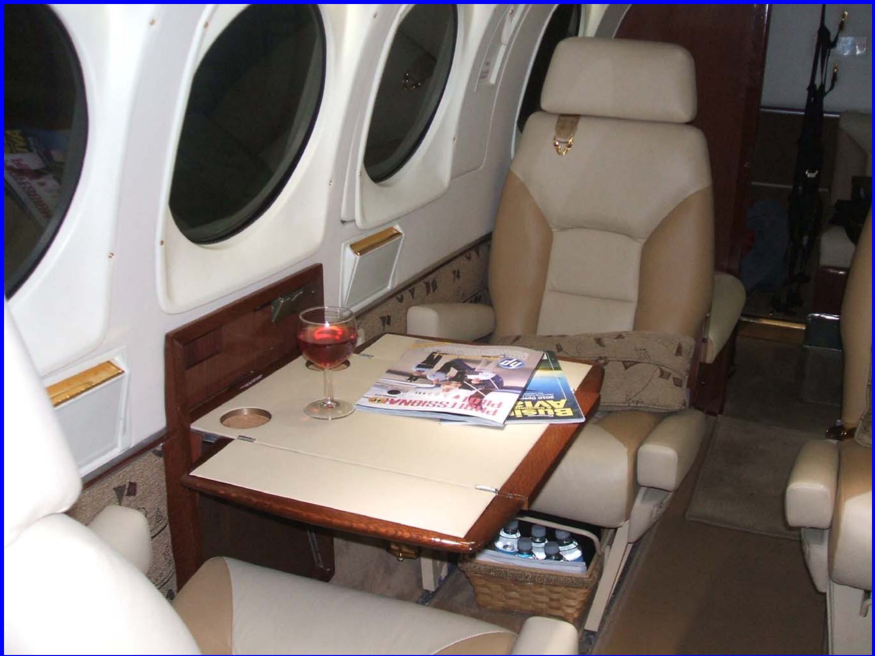
Specifications are preliminary and are subject to verification by purchaser Engine and Airframe times are current as of February, 2011